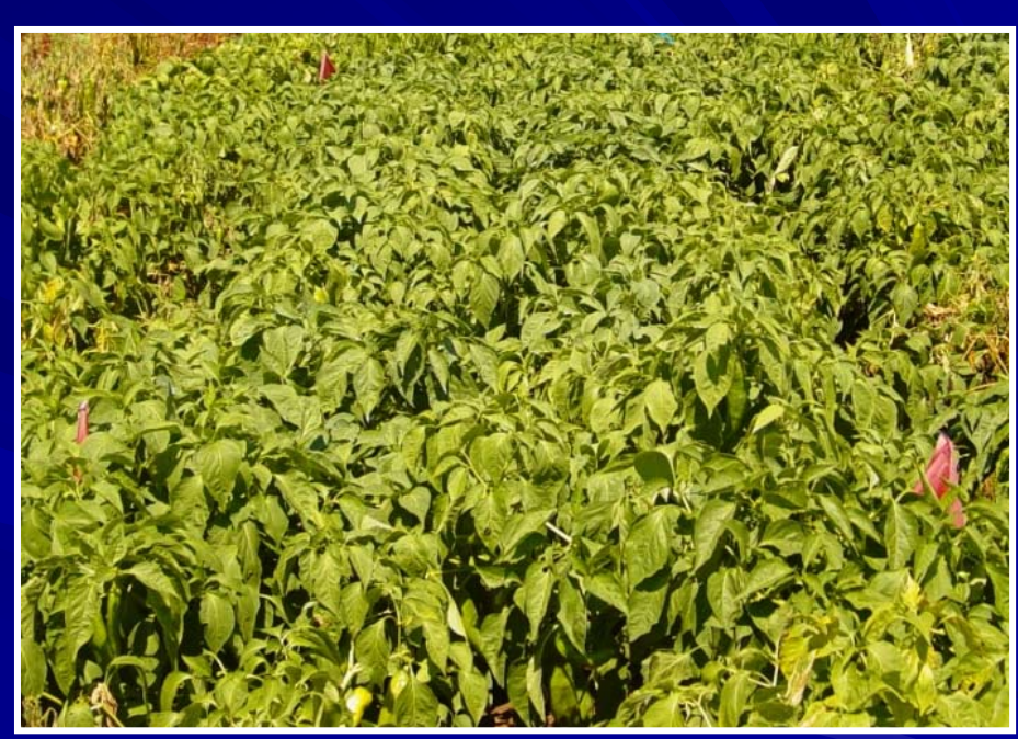
Ridomil Gold (A) Revus + Kocide DF (BCEF) Ridomil Gold Copper (DG)